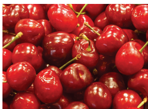
Tart Cherry Extract